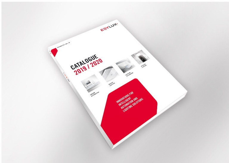
ESYLUX 2019/2020 catalogue