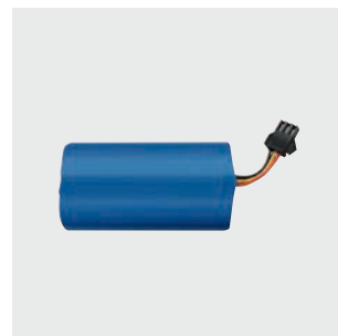
SLP-2 BATTERY Li-Ion 2200mAh