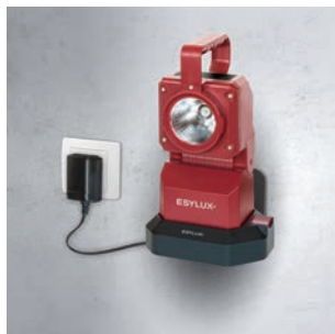
SLP-2 POWER SUPPLY