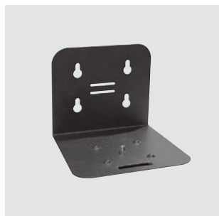
SLP-2 WALL MOUNTING PLATE