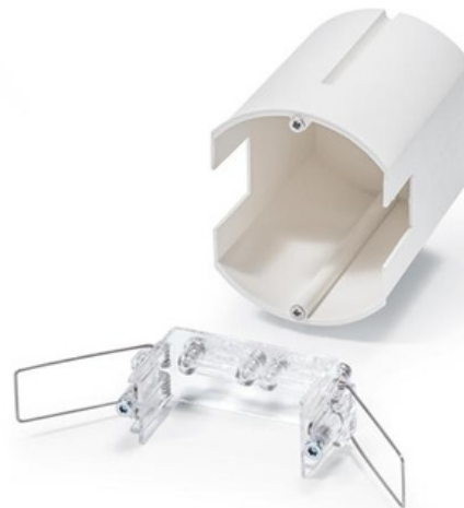
FLAT detectors + KIT